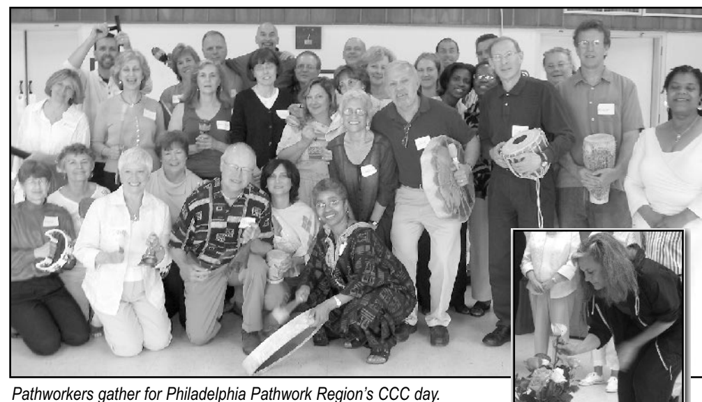
Pathworkers gather for Philadelphia Pathwork Region's CCC day.